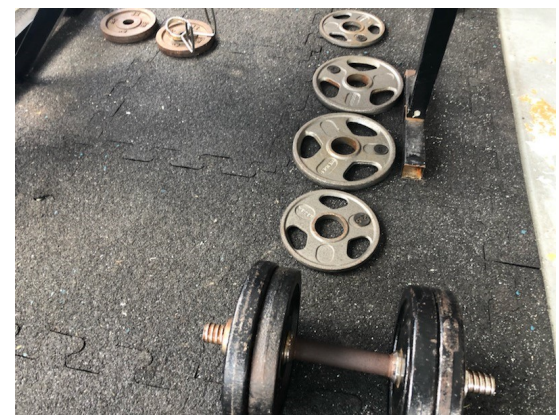
Please help us identify the equipment by letting us know you are the donor.